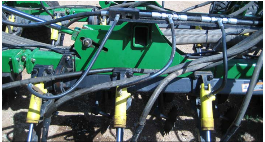
Photo M. 'Bridge' hose between drill sections in upper-left of pic.

5) Install the 3/4 x 56" cross-flow hoses between front & rear ranks on each wing section. These have large elbows built-in on both ends. Tighten all fittings.