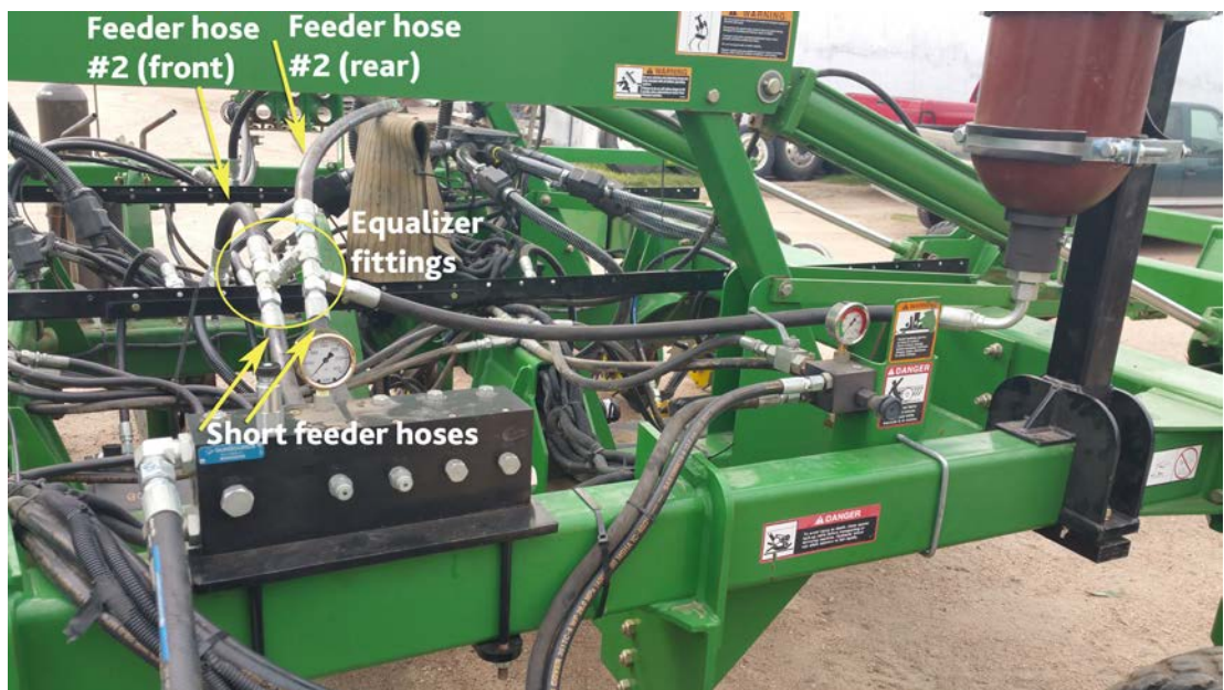
Photo N. 'Equalizer' fittings joining the feeder hoses on an 1890 w/ air cart. If 3 cartridges were used (to supply higher numbers of openers), there would be 3 short feeder hoses which would merge into the 2 long feeder hoses (one for each rank).

1) Locate bracket to secure UniForce manifold (valve block) onto frame, and attach it to underside of valve block with 4 screws w/ countersunk heads (use blue Loctite, provided). Set the bracket's legs (bolts) over frame at front-center of drill. Locate the bars that clamp bracket into position, slide them over bracket's stud bolts, and then flange locknuts—do not tighten yet.