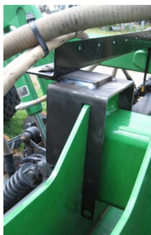
Photo F. LH wing: rear tray, inner end on 1890. Brkt #0006. Thru-bolt not yet installed. (1895's #0013 is slightly different)

3) Trays for wings are single-piece. Front wing trays attach their inner end using brkts #0005 (same on 1895). For outboard end, use #0004 (#0011 [or #0002] for an 1895). Install front trays as far forward as possible (but square to drill frame, not angled). Install all wing trays as far to the outboard direction as possible. Tighten all bolts & locknuts.