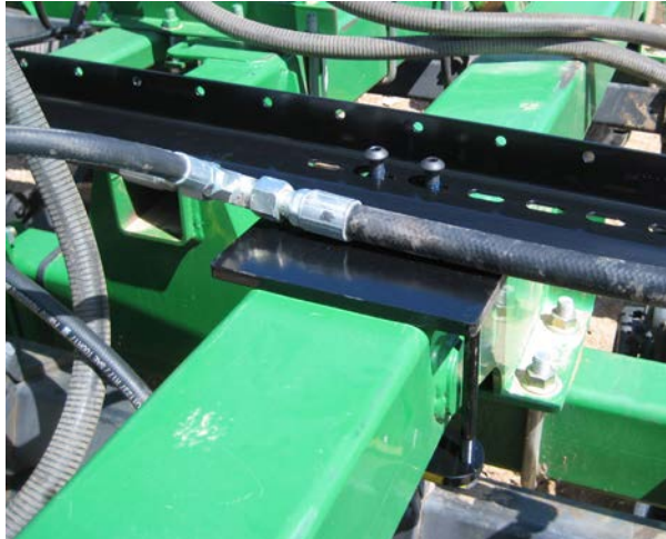
Photo G. RH wing: rear tray, outer end (40' 1890). Brkt #0003. Button-head bolts need to be tightened yet. Header hose is already assembled & lying across the bracket here. 1895 uses a narrower bracket at this location.