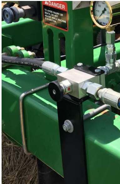
Photo K. UniForce valve block on box drill. Yours should have a 90-degree fitting on outboard side to reduce loop of hose needed.