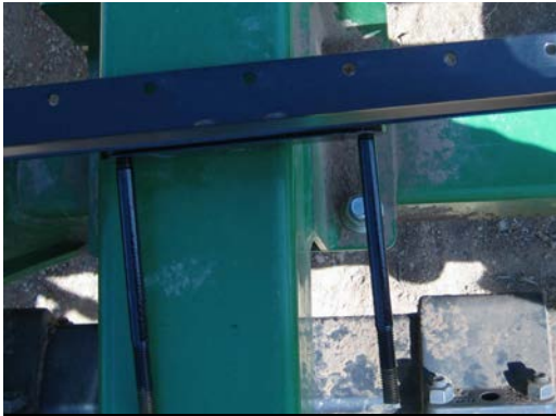
Photo E. RH wing outer end. Brkt #0004. Tray is attached via 1/2 x 3/4" buttonhead bolts threaded into U-bracket. Assembly pulled up off the frame tube for viewing.

1) Trays are only used on the wings. Wing trays attach their inner end using slotted brkt #0013 that sets over front gusset of frame tube, protruding forward , with 1/2" x 5.5" thru-bolt holding it (need photo).