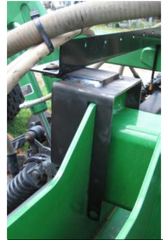
Photo F. LH wing: rear tray, inner end. Brkt #0006. Thru-bolt not yet installed here.

6) Carefully fold drill's wings, making sure trays don't hit each other. Now, tighten flange locknuts holding tray brackets in place.