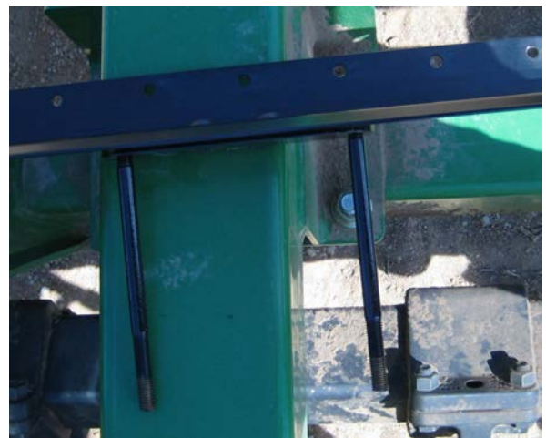
Photo E. RH wing: front, outer end. Brkt #0004. Tray is attached via ½ x ¾" buttonhead bolts threaded into U-bracket. Assembly pulled up off the frame tube for viewing.

2) For the front center trays, locate brackets #0002 and place them on the drill's center-section frame, over the fore/aft tubes (see Photo E—it's the same concept for all these brackets, except the rear center where the bracket comes up from underneath). Slide the 8" bar onto the brackets' studs from underneath, and then ½" flange locknuts—but