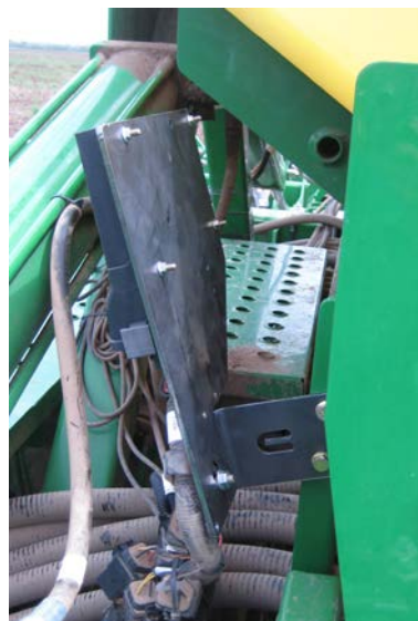
Photo H. When rear rank gets UniForce, the electrical bracket must be replaced w/ Exapta's #0023 (shown).