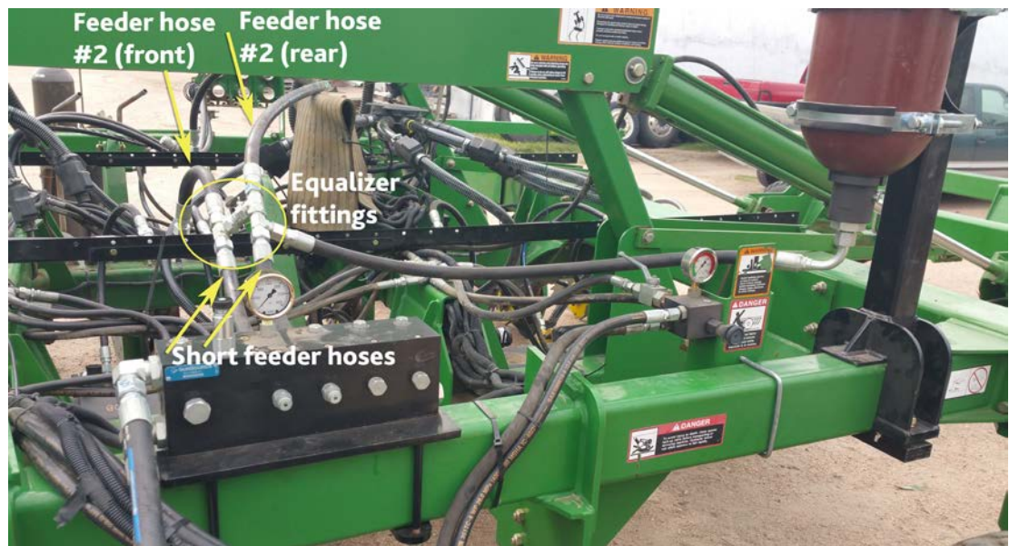
Photo N. 'Equalizer' fittings joining the feeder hoses on an 1890 w/ air cart. If 3 cartridges were used (to supply higher numbers of openers), there would be 3 short feeder hoses which would merge into the 2 long feeder hoses (one for each rank).

feeder hoses (3/4") to each other approx 20" downstream (rearward) of valve block (if an accumulator is used, it plumbs into this location as well), then into 2 long feeder hoses. See Photo N.