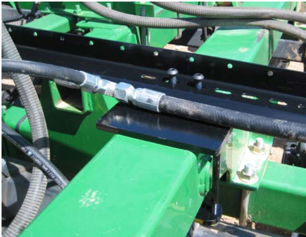
Photo G. RH wing: rear tray, outer end. Brkt #0003. Button-head bolts need to be tightened yet. Header hose is already assembled & lying across the U-bracket here.

4) Rear wing trays on inner end use a slotted bracket #0006 (Photo F) (#0013 for an 1895) that sets over rear gusset of frame tube, with 1/2" x 5.5" thru-bolt holding it. Outer end of tray uses brkt #0003 (Photo G).