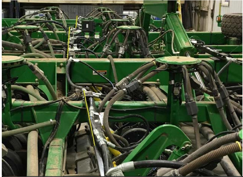
Photo B. Yellow lines show the offset of tray position on center vs wings. This is an 1895, hence the extra towers and extra rank. All trays go on top of frame tubes except center rear on CCSs.

1) Trays are positioned directly above the rank of openers that they serve. Position center trays at an offset fore/aft so they aren't directly in line with wing trays (see Photo B) (they need clearance when wings fold). Center front trays are spliced on 40 & 42/43-ft models; center rear (low-profile) trays are spliced on all CCS drills. Locate the halves, and prepare* to fasten them together using splicer (sheet metal piece that fits on underside of tray to join the halves), and ½" x ¾" button-head bolts and flange locknuts on bottom (button-heads on inside, where hose will lie), and with 5/16 x ¾" hex-head bolts, flat washer & locknuts on the side (upright portion of tray). Be sure to fasten the tray ends together that have only 4 holes, not the series of holes which belong on outer ends of tray (see Photo C). (*Some tray splices are most easily joined after sliding each half into position, rather than pre-assembling—especially center-rear.)