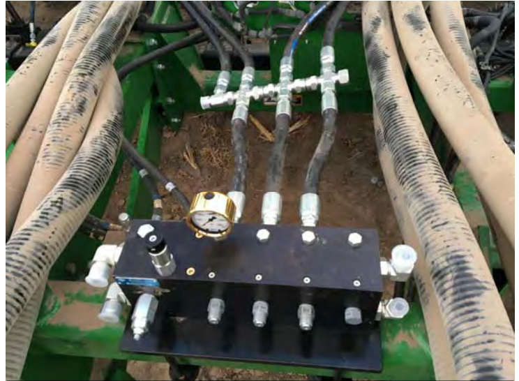
Photo M. Manifold installed on a 5-section drill with TBT cart. 3 cartridges used, so 3 short feeder hoses going into 4 long 222" feeders, with places for 2 accumulators to plumb into the ends of equalizer fittings.

5) If an accumulator is being used: assemble it, mount it on the frame (see photo), and connect it to the fittings that equalize the feeder hoses just behind the valve block ( don't use the port on the